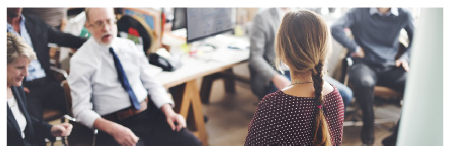
BBE Training, Citrus Group House, Diamond Way, Nene Park, Irthlingborough, Northamptonshire, NN9 5QF

We may also collect your computer's IP address to help us tailor the service to your location.