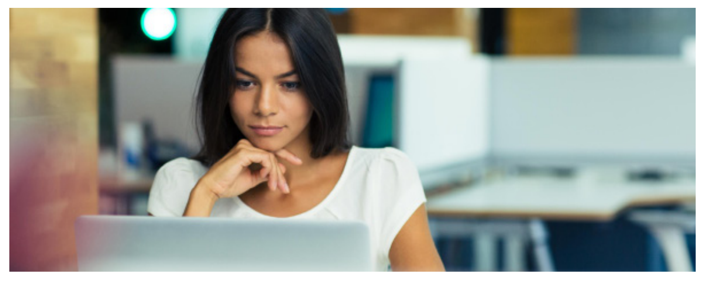
BBE Training, Citrus Group House, Diamond Way, Nene Park, Irthlingborough, Northamptonshire, NN9 5QF

We are committed to ensuring that your information is secure. In order to prevent unauthorised access or disclosure, we have put in place suitable physical, electronic and managerial procedures to safeguard and secure the information we collect from you.